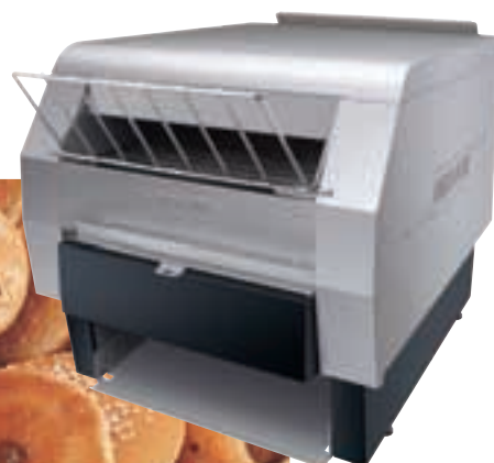
TQ-800BA with accessory security control cover